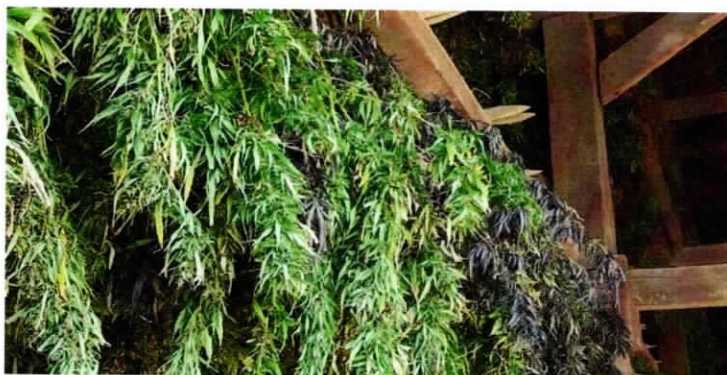
Farm to Pharmacy:

Ananda Professional's 100% Kentucky grown hemp is planted, harvested, and dried using existing Kentucky tobacco infrastructure and knowledge. Kentucky farmers are now making the switch to farming Hemp with the passing of the 2018 Farm Bill and Ananda Professional is right beside them providing superior genetics and support.